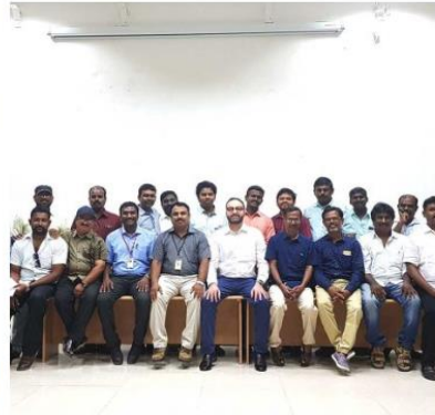
State of Tamil Nadu