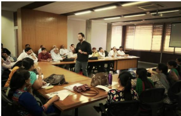
Knowledge Consortium Gujarat