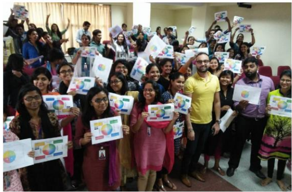
University Student – Brain Map