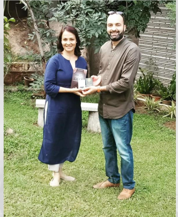
Foreword by Amala Akkineni, Actor