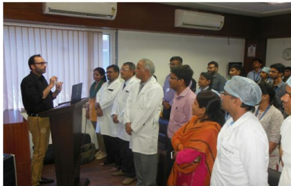
Hospital Staff & Doctors