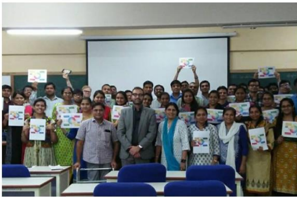
College Staff – Brain Mapping